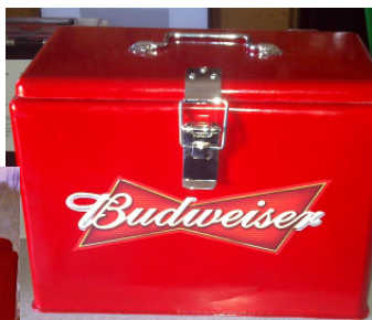
As I was preparing these two, the original Budweiser decals showed up under some previous repaint. The decals on these coolers are now different, but the coolers are originals.