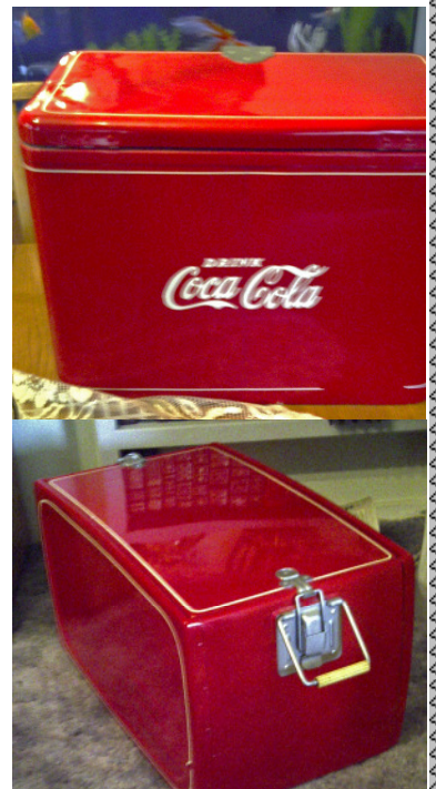
These were done by my sister Gale's late husband Scotty. They are full of older coke bottles.