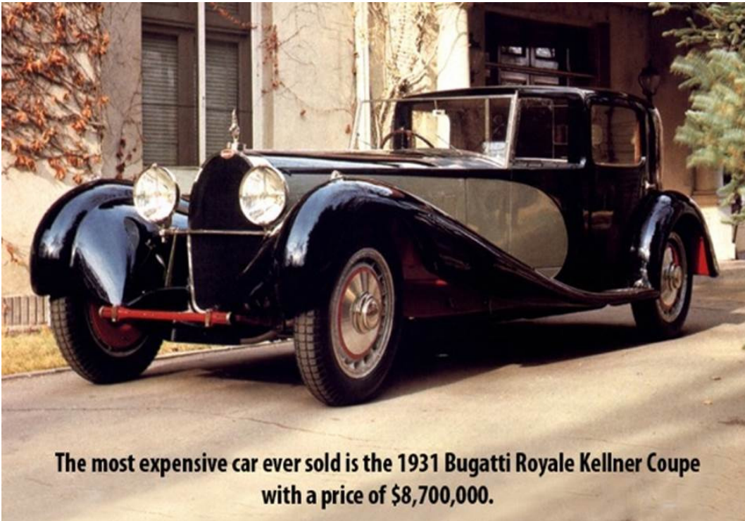
The most expensive car ever sold is the 1931 Bugatti Royale Kellner Coupe with a price of $8,700,000.