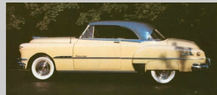
1950 Hardtop Coupe