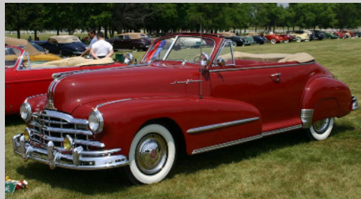
1948 Silver Streak Convertible

Along with new styling came a new model. Continuing the Native American theme of Pontiac, the Chieftain line was introduced to replace the Torpedo. These were built on the GM B-Body platform and featured sportier styling than the more conservative Streamliner.