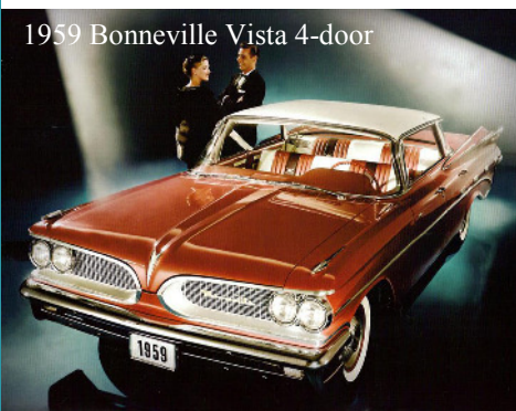
1959 Bonneville Vista 4-door

While new car buyers could buy a Cadillac for that price, the Bonneville raised new interest in what Pontiac now called “America’s No. 1 Road Car.”