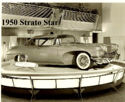
1954 Star Chief