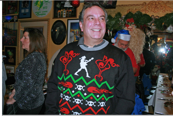
If I don't survive the presidency, at least I had this great evening to remember!