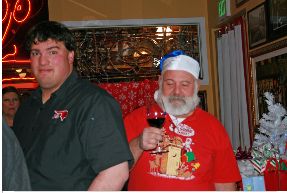
Now if I could just remember what it is that I am drinking.